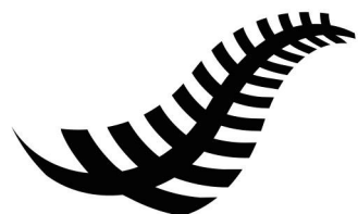
Junior Black & White Sox